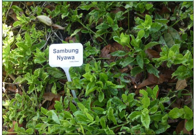
Sambung Nyawa will grow in the shade of a tree. Leafy greens prefer shade as they often evolved as groundcovers in tropical forests. Growing them in the shade helps the leaves to stay tender and mild in flavour.