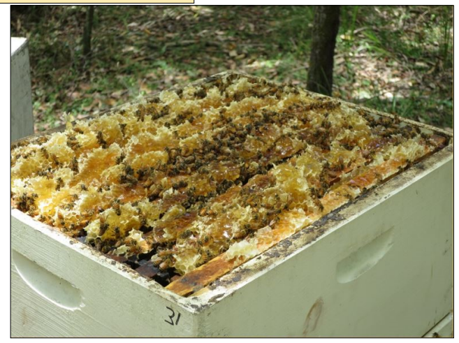
Good season with bees building burr comb on top of frames.