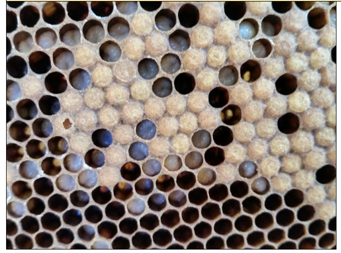
Healthy brood showing worker bee grubs being capped off to pupate. Bacterial diseases such as American and European foul brood sends the brood rotten.