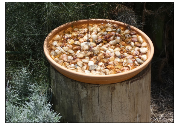
Red Tower Ginger, Costus comosus (below) - the flowers are edible. Note the grevilleas either side. They are good natives for birds.

WATER FOR BEES—bird baths are NOT suitable for bees, as they like to suck the water up and land on something shallow. Place shallow plastic or terracotta dishes with rocks in them in your garden to help bees stay alive in our hot summer.