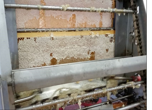
Left—perfect new comb just drawn from foundation comb and ready to go through the uncapping machine.

Above—Combs going through the uncapper with reciprocating knives cutting the cappings off the cells.