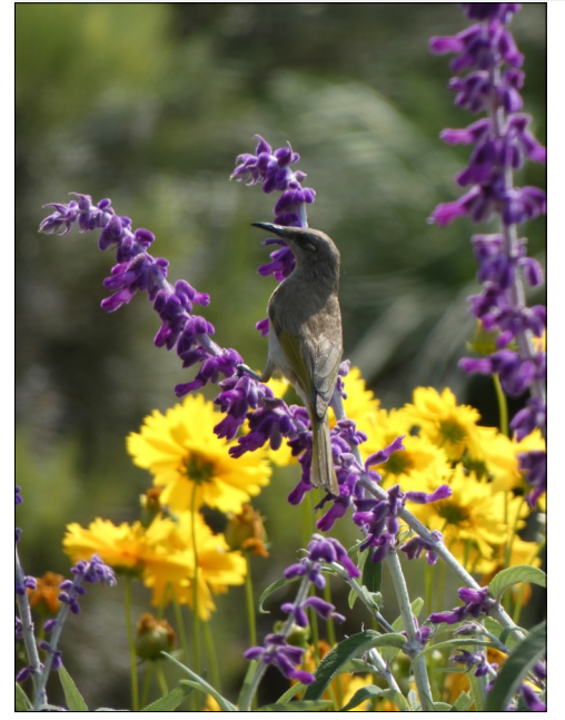
Brown Honeyeater enjoying nectar from Salvia.