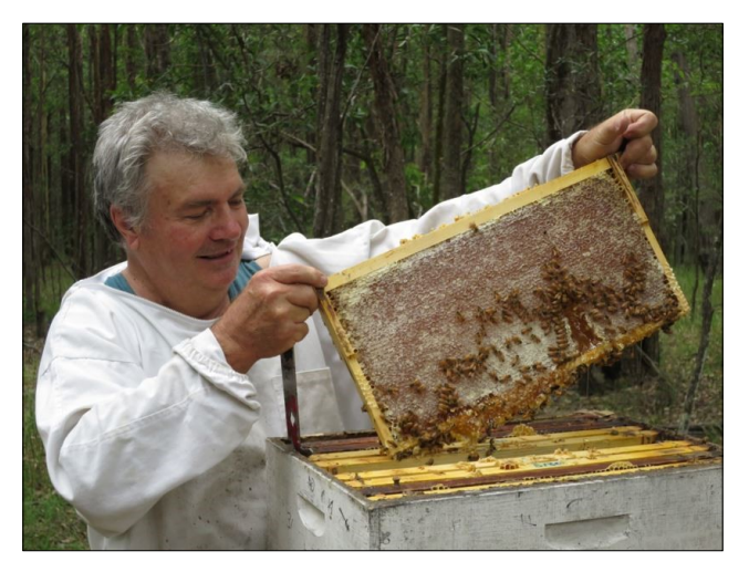
Checking combs prior to placing a clearer board on to take off a super of honey.