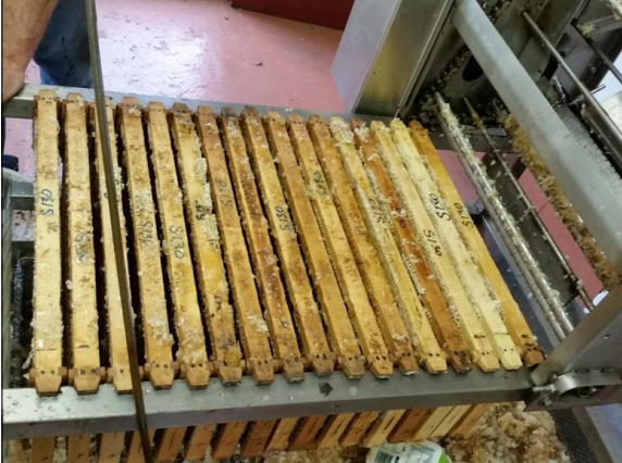
Above—Line of uncapped frames ready to go into the extractor.

Above—Combs going through the uncapper with reciprocating knives cutting the cappings off the cells.